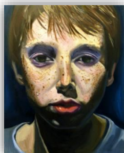
Calypso (Year 13)