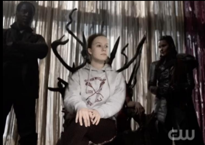
Darya 8R The 100