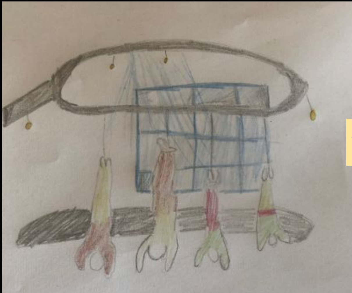
Andrra 8T The Maze Runner