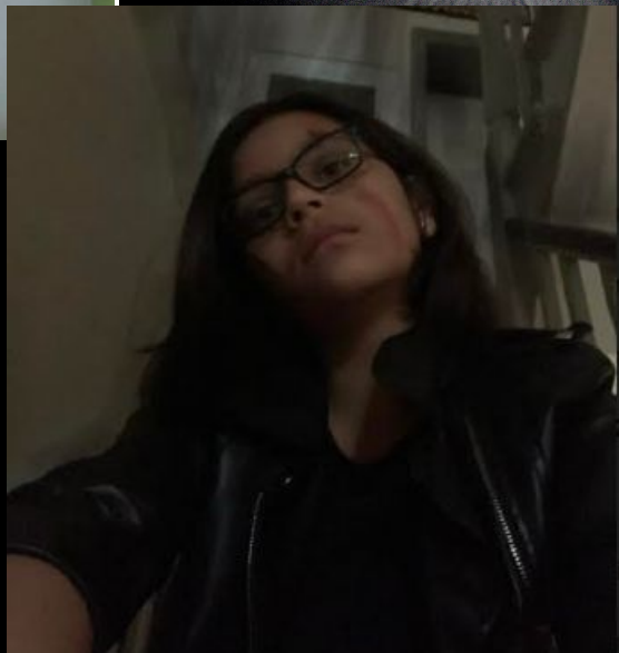
Amyrah 8C The Darkling